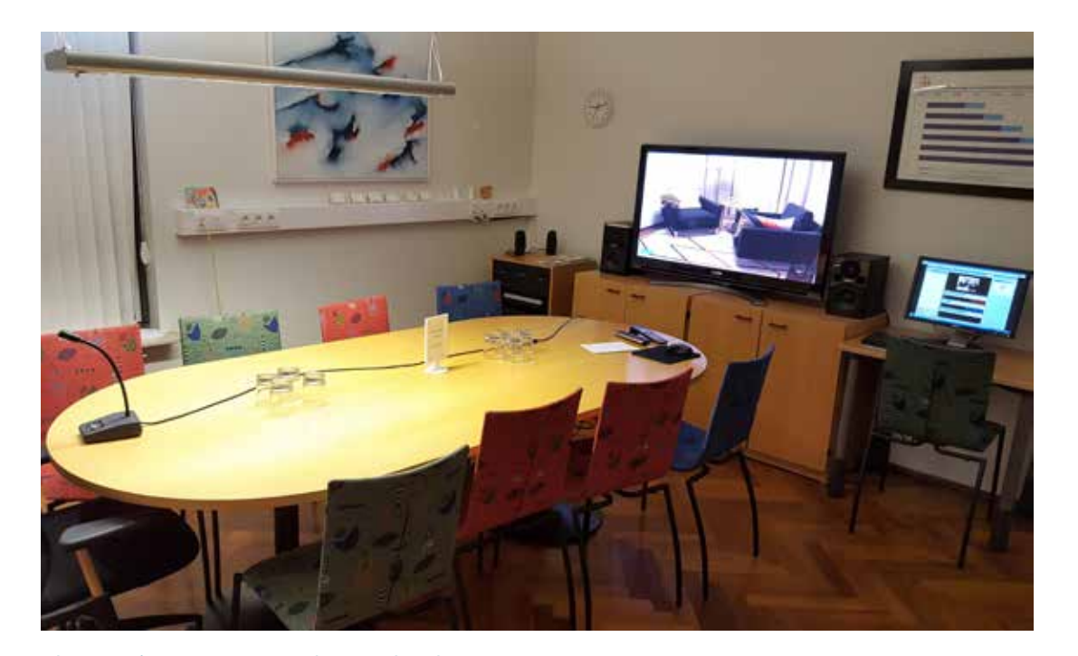
Observation room, Barnahus Iceland