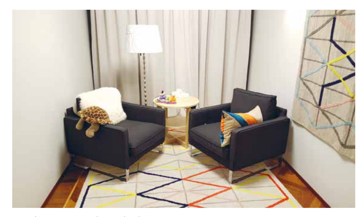
Interview room, Barnahus Iceland