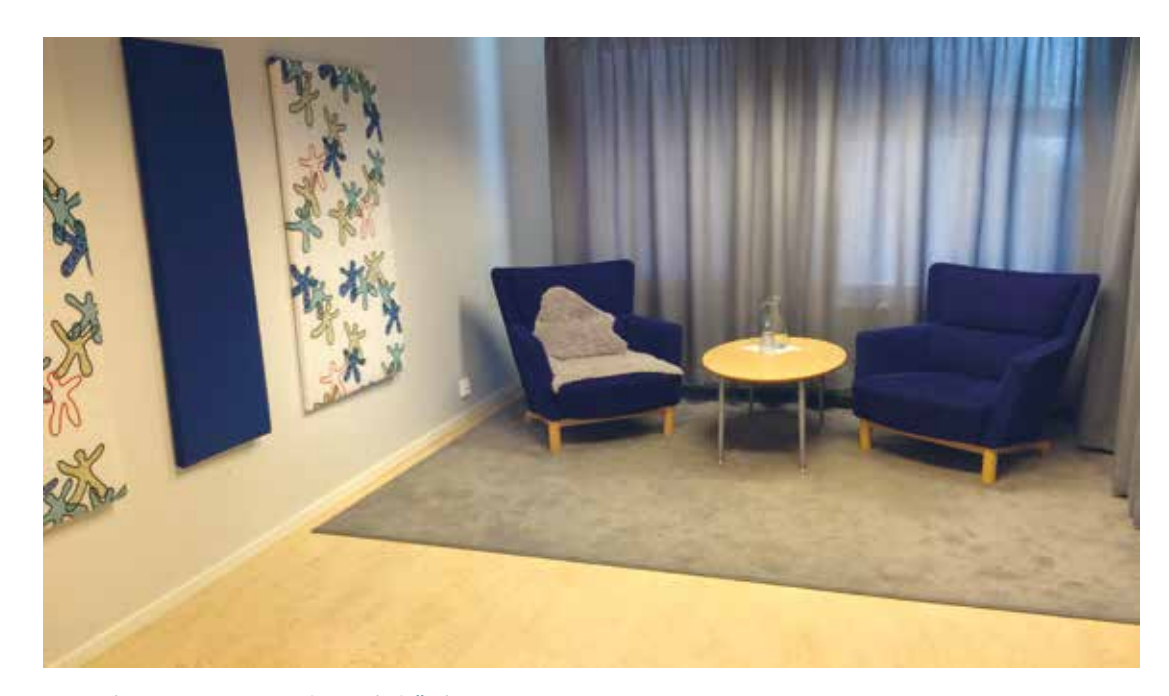
Interview room, Barnahus Linköping

tection Service staff can watch the interview with the child live through a computer screen and are able to communicate with the interviewer.