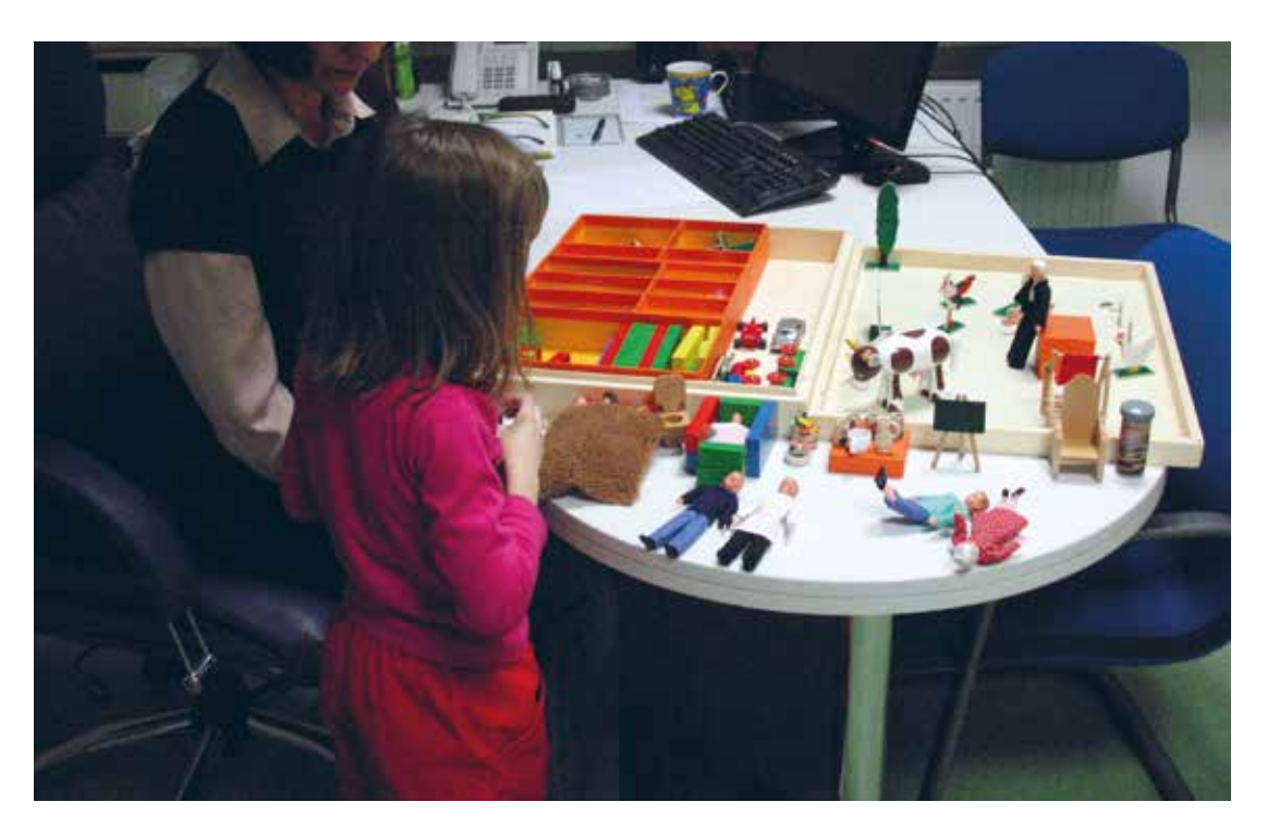
Therapy session, Child and Youth Protection Centre, Zagreb

The Centre is often exposed to the challenge of responding to the child's needs in a timely manner without influencing the child's testimony. The court proceedings in Croatia can some-