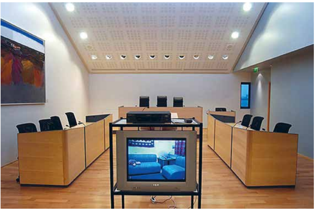
Observation room, Child and Youth Protection Centre, Zagreb

During exploratory interviews , a child protection worker observes the live interview in an adjacent room through a TV screen or a computer screen.